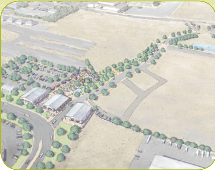
Phase One Initial Infrastructure