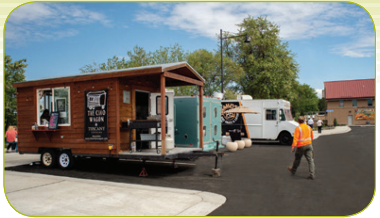
The Food Truck Plaza at the Village is now open at Columbia Gardens

Contact the food vendors directly from their Facebook business pages for locations, days and hours of operation, and menus. Learn more at PortofKennewick.org/Projects/Columbia-Gardens .