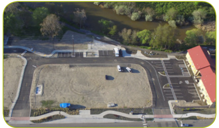
New public features including a food truck plaza were recently completed at Columbia Gardens along Columbia Drive in Kennewick

The building is anticipated to be completed early 2020 and will house tasting rooms for both Cave B Estate Winery and Gordon Estate Winery. Those wineries are joining Bartholomew Winery and Monarcha Winery, which established production space and tasting rooms at Columbia Gardens in February 2018.