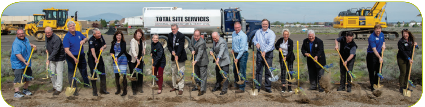
Port, City of Kennewick, Benton County, and contractor officials turn the first shovels of dirt at the Vista Field phase one groundbreaking ceremony