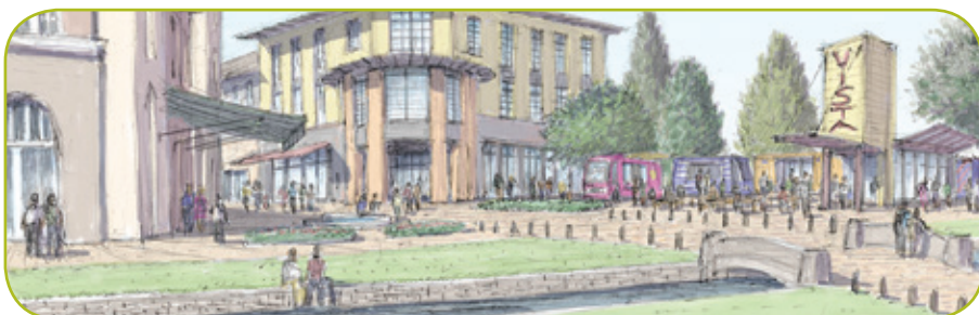
Commercial Shared Streets