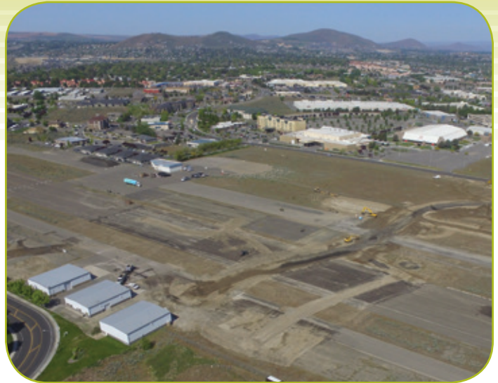
Roadways taking form as construction begins at Vista Field