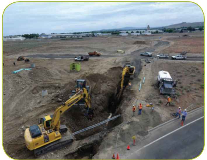
Crews installing phase one infrastructure