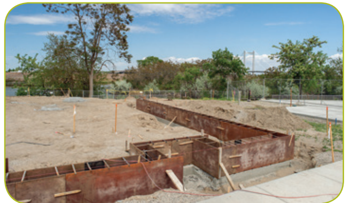
Work is underway on the fourth wine building at Columbia Gardens, which will house two tasting rooms