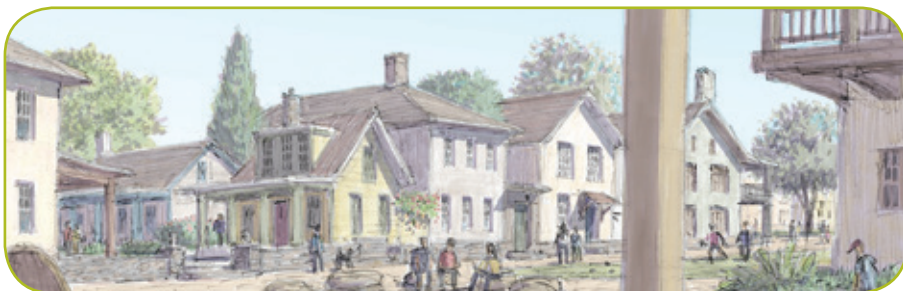
Residential Shared Streets

Vista Field is about placemaking and it will offer an extremely walkable, lively district where residents, business owners, and visitors alike can interact in a vibrant, unique urban space like nothing the region has seen to date.