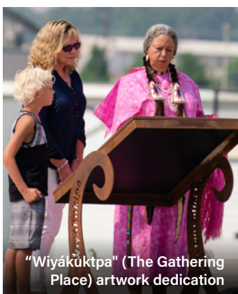
"Wiyákuktpa" (The Gathering Place) artwork dedication

Former CTUIR Executive Director & Nixyáawii Community Financial Services Executive Director