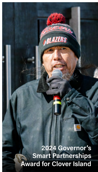
2024 Governor's Smart Partnerships Award for Clover Island