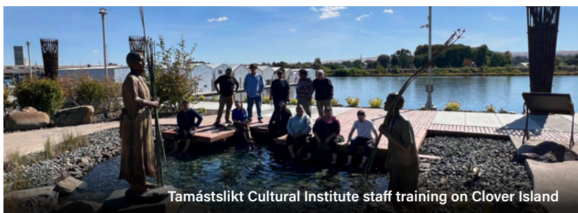
Tamástslikt Cultural Institute staff training on Clover Island