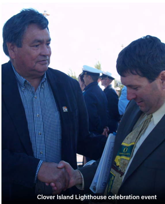
Clover Island Lighthouse celebration event