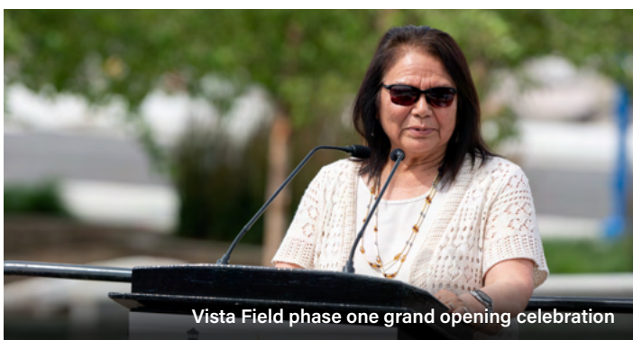
Vista Field phase one grand opening celebration