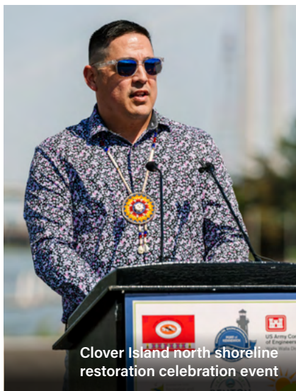
Clover Island north shoreline restoration celebration event