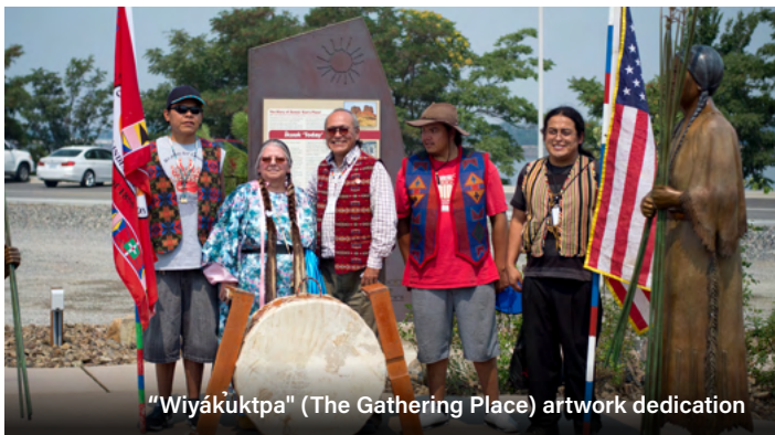
"Wiyákuktpa" (The Gathering Place) artwork dedication

"The MOU was a major step and unique because our expectations are focused on friendship and understanding rather than transactions. These types of documents ensure we're aligned and provide 'marching orders,' even if they go unused for long periods."