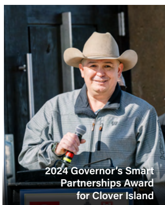
2024 Governor's Smart Partnerships Award for Clover Island