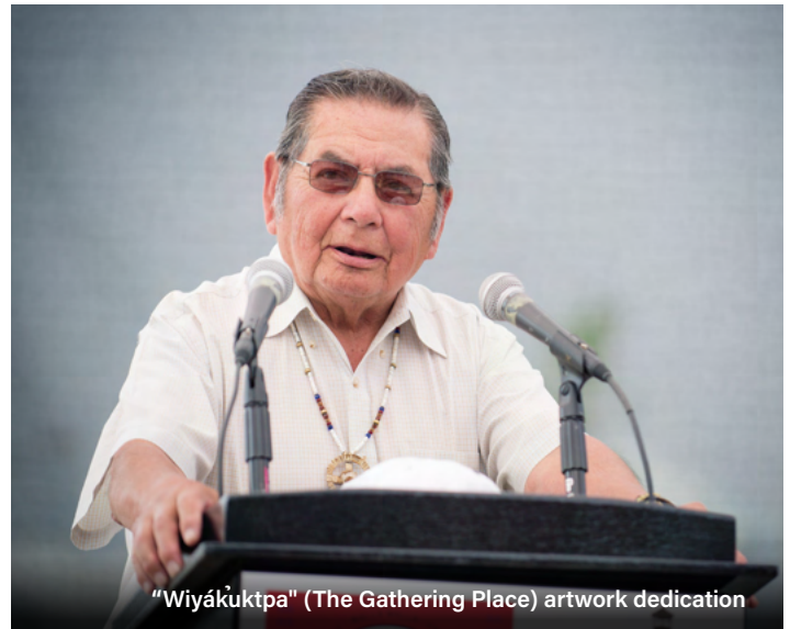
"Wiyá'kuktpa" (The Gathering Place) artwork dedication