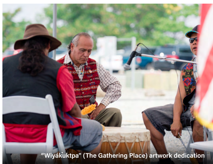
"Wiyákuktpa" (The Gathering Place) artwork dedication