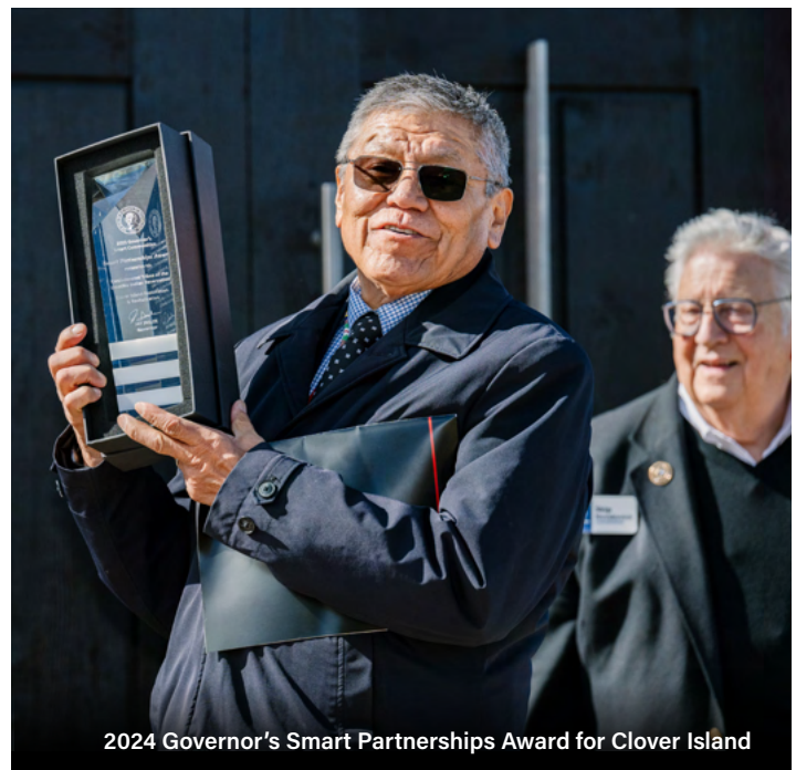
2024 Governor's Smart Partnerships Award for Clover Island

As new Port and CTUIR staff and leadership are introduced, the partners desire that this strong relationship will continue, not as a transactional one, but with meaningful interactions and cooperation on projects of mutual benefit. And that the Port-CTUIR relationship might serve as a model to other municipalities as they seek authentic engagement with Tribes.