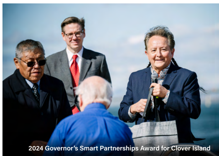
2024 Governor's Smart Partnerships Award for Clover Island