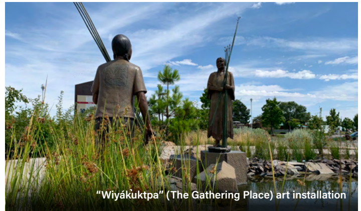
"Wiyákuktpa" (The Gathering Place) art installation

A notable collaboration is the "Wiyákuktpa" (The Gathering Place) art installation on Clover Island. The artwork and interpretive panels honor the CTUIR's tradition of harvesting tule reeds and capturing fish with woven willow baskets. In 2017, the partners celebrated completion of the installation with a community unveiling ceremony, commemorating the Tribes' ties to Ánwaš (Clover Island) and nčǵ-Wána (Columbia River).