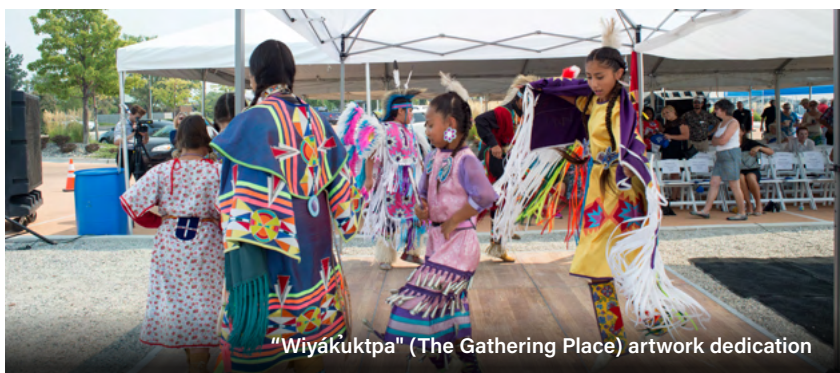
"Wiyákúktpa" (The Gathering Place) artwork dedication