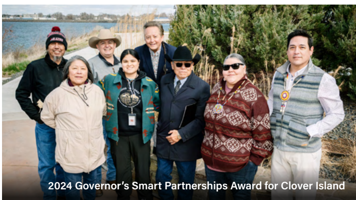
2024 Governor's Smart Partnerships Award for Clover Island