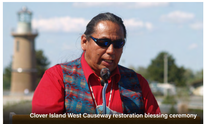
Clover Island West Causeway restoration blessing ceremony