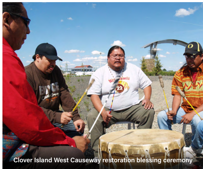
Clover Island West Causeway restoration blessing ceremony