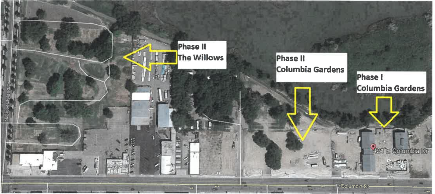
EXHIBIT A Project Area