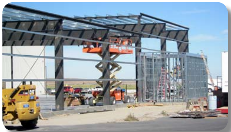
Construction underway at Pacific Rim Winemakers.